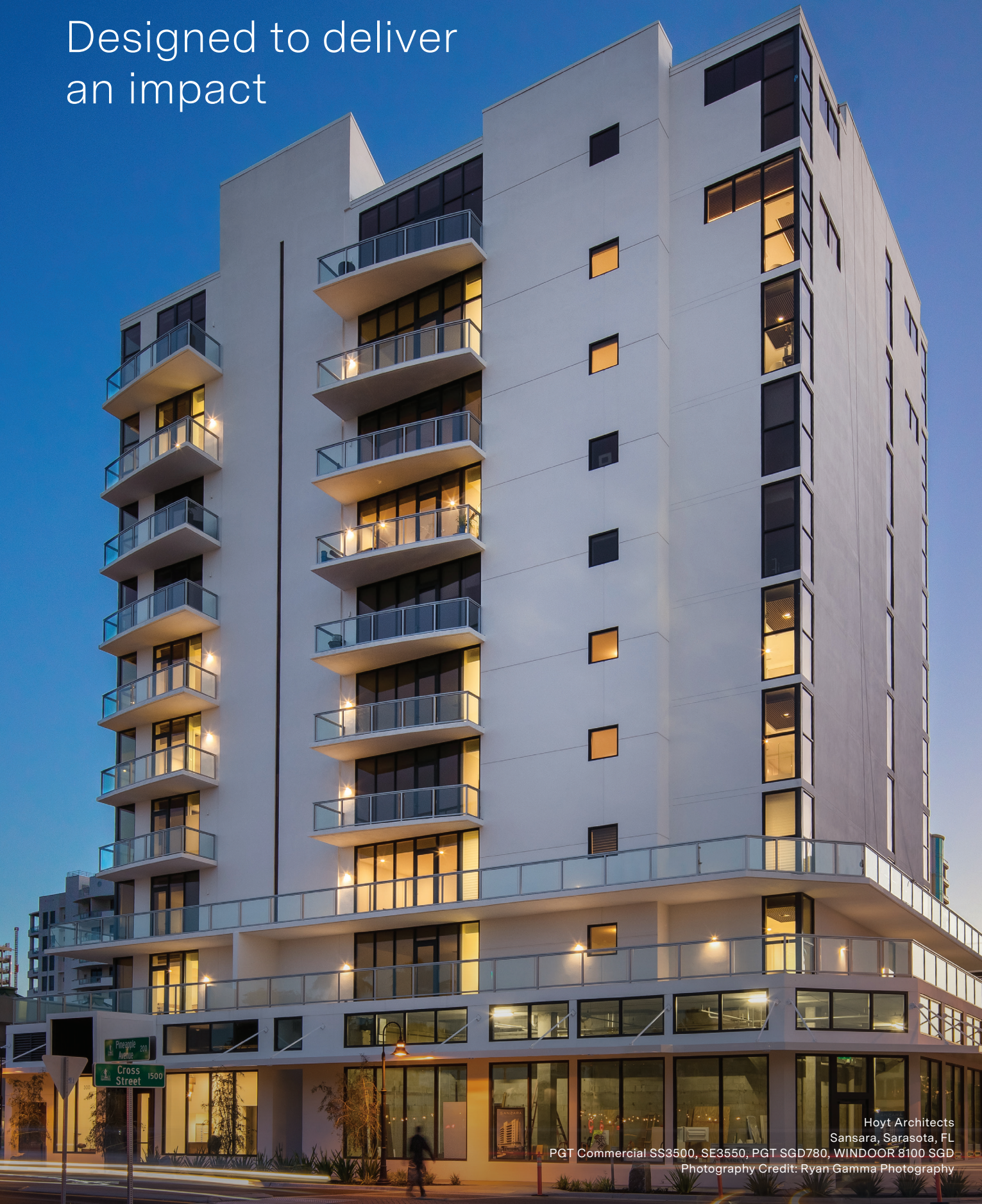
Hoyt Architects Sansara, Sarasota, FL PGT Commercial SS3500, SE3550, PGT SGD780, WINDOOR 8100 SGD

PGT Commercial manufactures products that deliver solutions for some of the most demanding commercial and residential applications in the industry. Our windows and doors are built to withstand and protect, providing strength that is second to none.