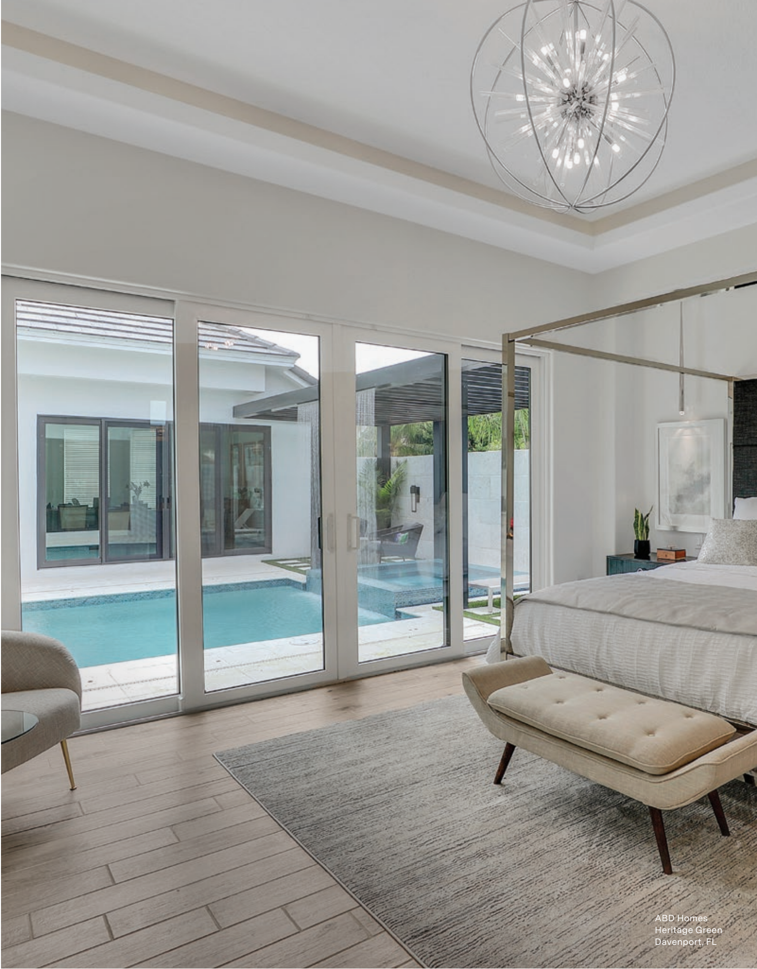
ABD Homes Heritage Green Davenport, FL