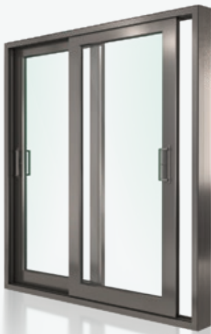
WinGuard® SGD5570 (Impact-Resistant)