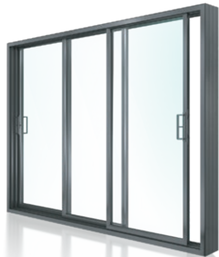
WinGuard® SGD5570NS (Impact-Resistant)