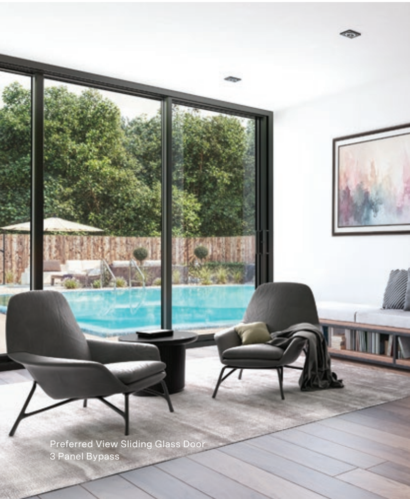
Preferred View Sliding Glass Door 3 Panel Bypass