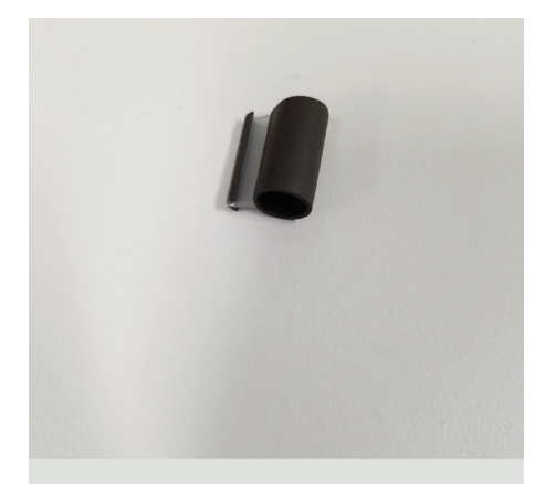
Inactive astragal end seal weather-strip