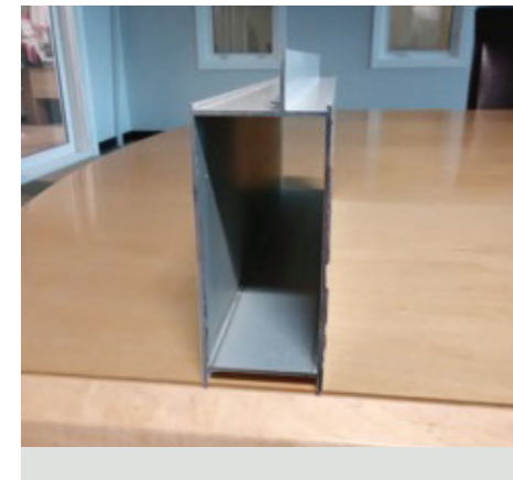
Top & bottom rail (ordered by unit size or 12" sample)