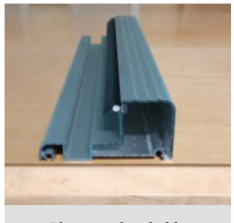
1-1/2" bumper threshold (ordered by unit size or 12" sample)