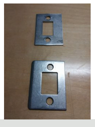
Deadbolt & handle strike plate