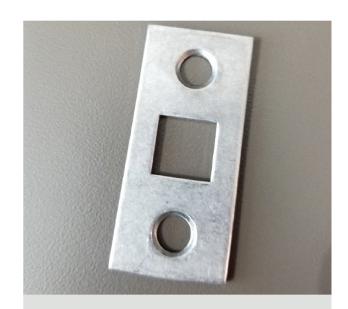
2-point/inactive flushbolt header strike plate