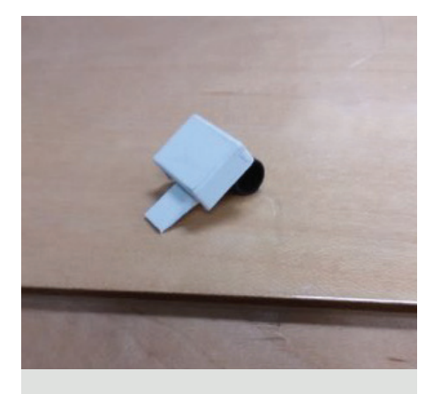
Double door inactive astragal end seal