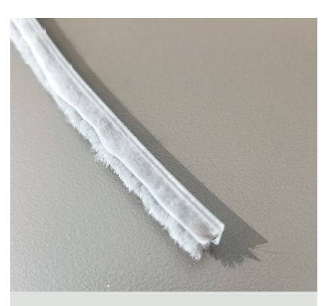
Top/bottom sweep weather-strip