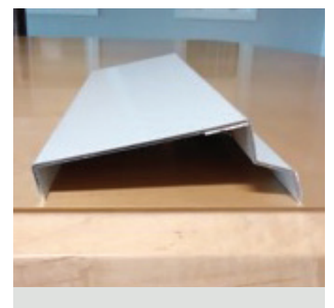
\begin{array}{l} \textbf{Drip cap} \\ \textit{(ordered by actual cut size or unit size)} \end{array}