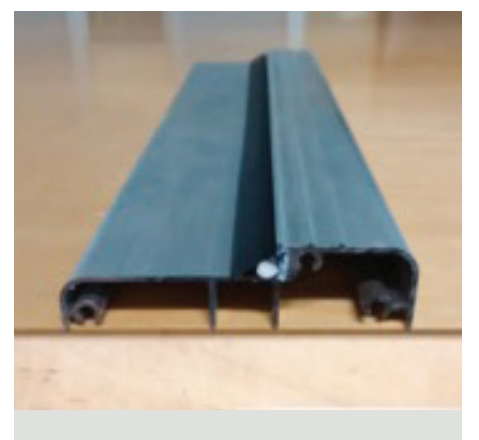
Low-rise bumper threshold (ordered by unit size or 12" sample)