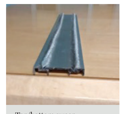
Top/bottom sweep w/weather-strip (ordered by unit size or 12" sample)