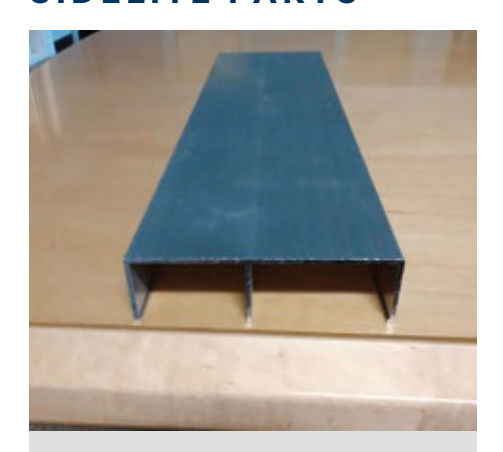
\label{eq:Adapter} A dapter \\ \textit{(ordered by actual cut size or unit size)}