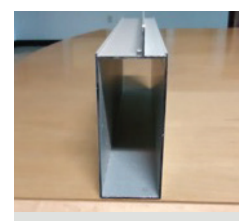
Stile – hinge side (ordered by unit size or 12" sample)