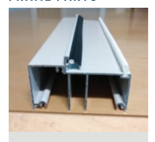
Head (ordered by unit size or 12" sample)