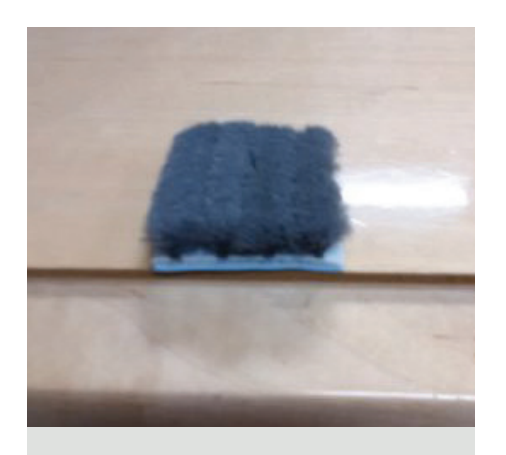
Inactive slab dust plug