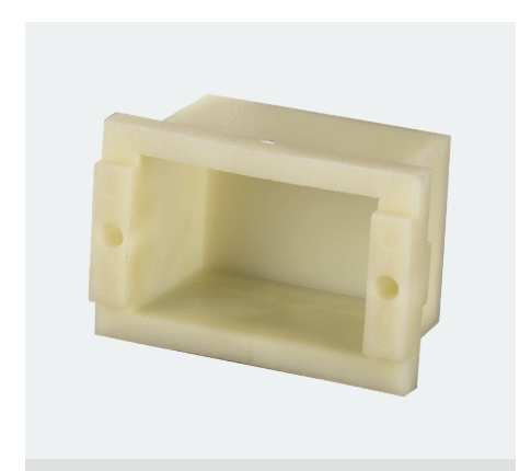
Strike plate insert