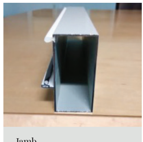
Jamb (ordered by unit size or 12" sample)