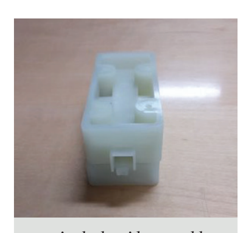
2-point lock guide assembly