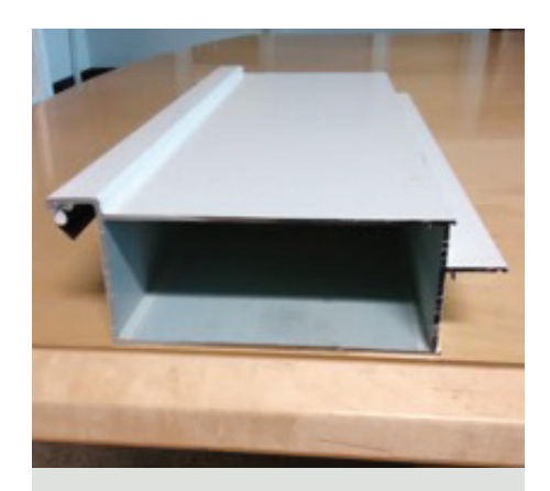
Stile – inactive astragal (ordered by unit size or 12" sample)