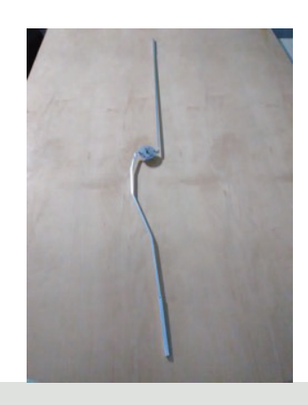
2-point lock assembly (ordered by unit size)