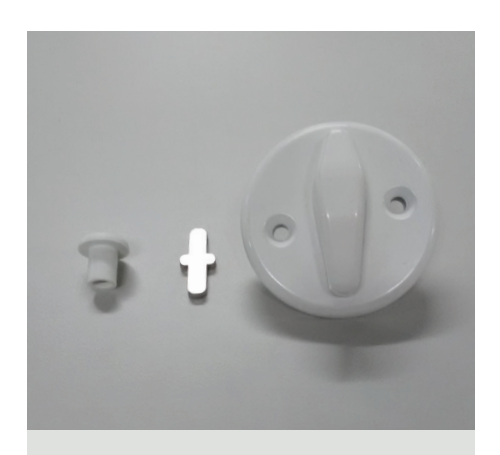
2-point lock thumb turn assembly