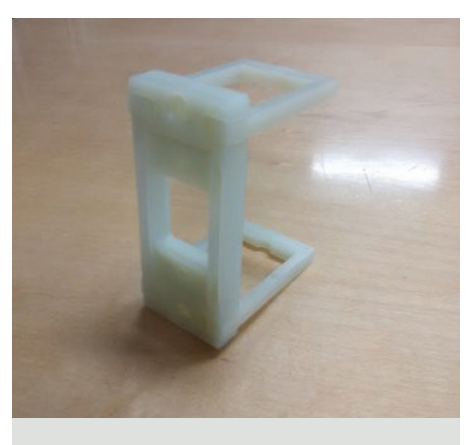
Lock support assembly