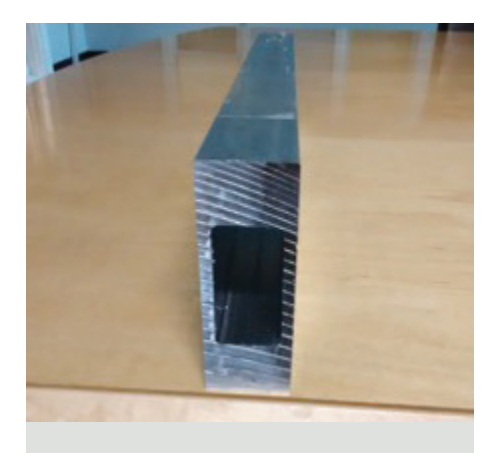
Sidelite reinforcement (ordered by unit size or 12" sample)