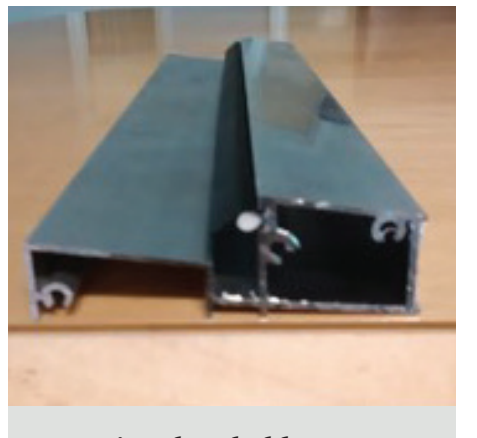
In-swing threshold (ordered by unit size or 12" sample)