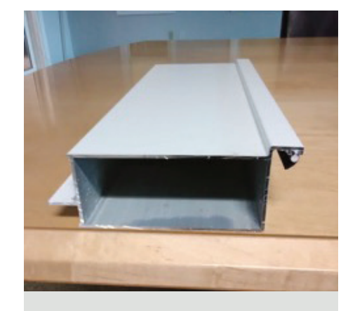
Stile – active astragal (ordered by unit size or 12" sample)