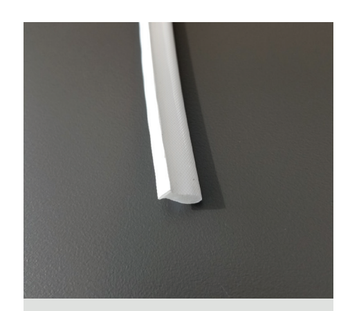
Frame head & jamb weather-strip (outer)