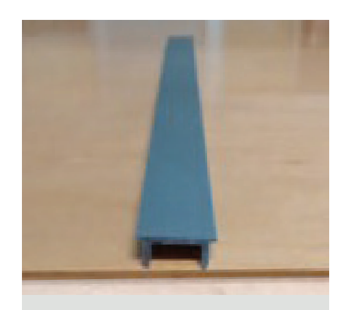
Threshold installation screw cover (ordered by actual cut size or unit size)