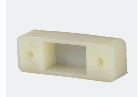
Low-rise bumper threshold cup & screws