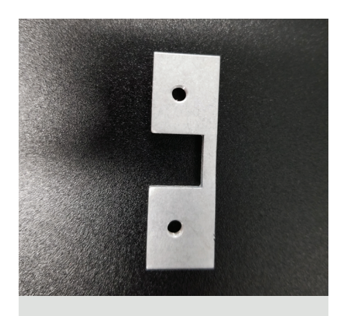
Frame head strike plate backing plate